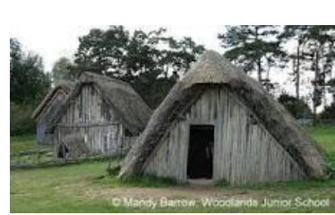
A typical Anglo-Saxon house