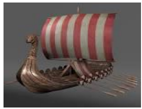
A Viking longship

Who was involved in the Battle of Hastings? Edward the Confessor died in 1066, he had no children so a battle for the throne commenced. The 3 main contenders were Harold Godwinson (Edward's brother in law), William of Normandy (France) who said Edward promised him the throne and Harald Hardrada who was a Viking and king of Norway and a distant relative of a previous king.